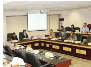
Discussion on Japan's Geopolitical-Strategic Changes page. 4