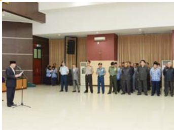
Flag-Raising Ceremony: Lemhannas RI Governor Put Emphasis on 7 Important Aspects page 2