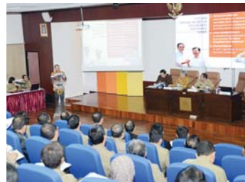
Information Event on Placement of Top Officials page. 6